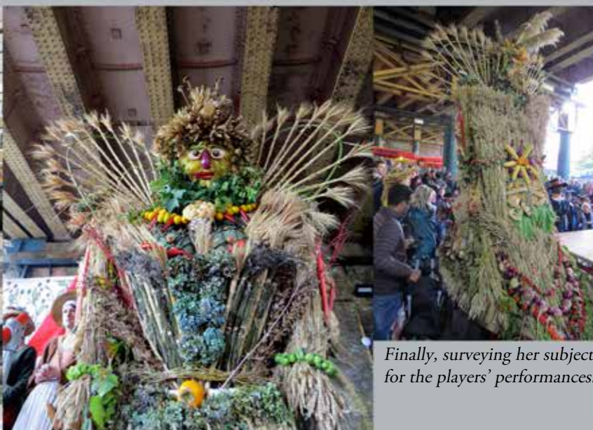
onto the market trolley and out into the streets.