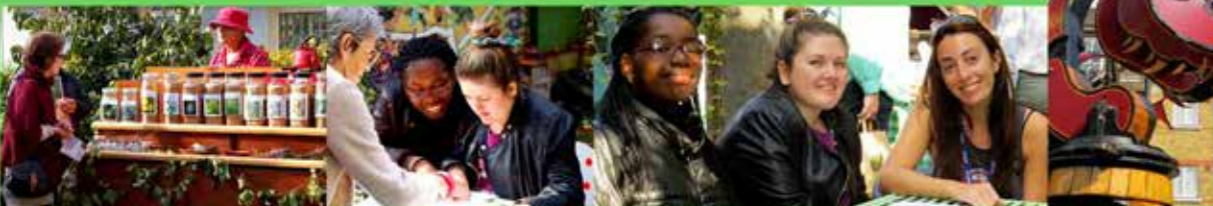
Good retail experience and Valentino's Jazz Band.