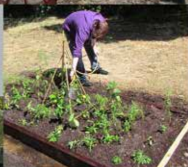
new bed for a neighbour