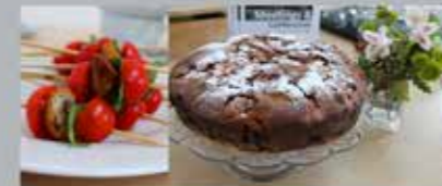
phillip, carlene, constance